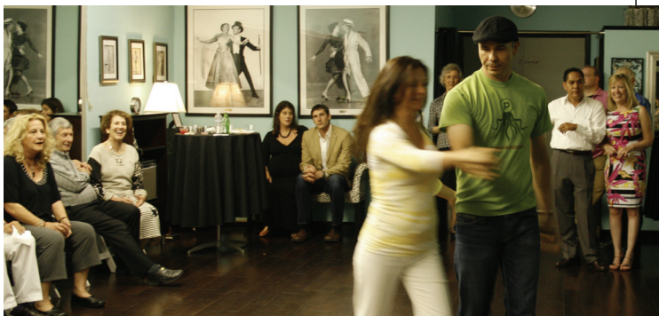
Dancers learning their steps

Thank you to all the guests who attended, bought raffle tickets and those who sent donations - you all helped to make the evening a great success!